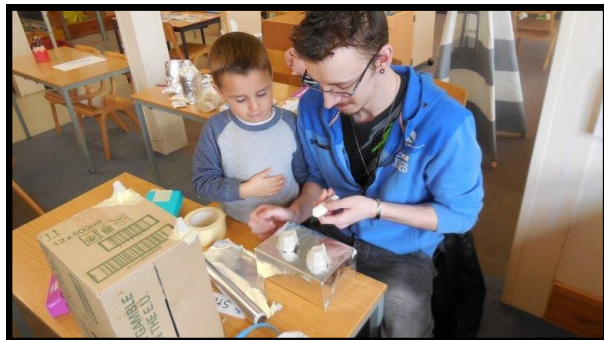
Bring Your Parent To School Day

Communicating Communication between Baltasound JHS and parents should be prioritised, regular, jargon free, clear, accessible and specific. Communication throughout the year will include the following: