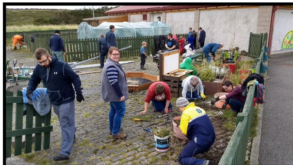
BJHS Community Day

Volunteering Baltasound JHS will provide opportunity for, and promote, volunteering amongst the parent forum. This will include opportunities to: