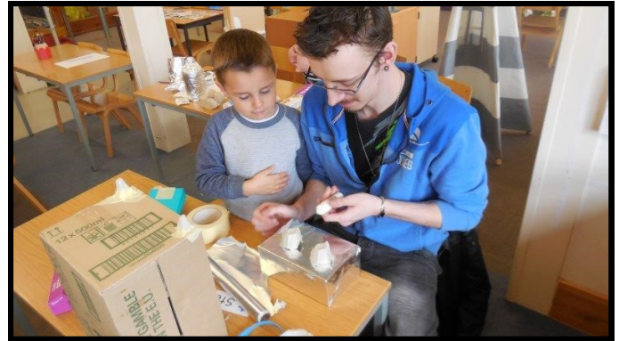
Bring Your Parent To School Day

Communicating Communication between Baltasound JHS and parents should be prioritised, regular, jargon free, clear, accessible and specific. Communication throughout the year will include the following: