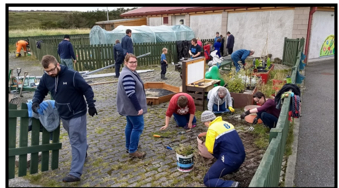
BJHS Community Day

Volunteering Baltasound JHS will provide opportunity for, and promote, volunteering amongst the parent forum. This will include opportunities to: