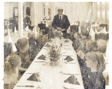
1912 - Titanic First Class Lounge. Or is it?