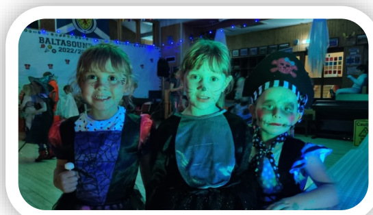
Some of our spooky party-goers

As we all settle into Term 2, we have plenty to look forward to over the next 6 weeks or so. We have our P4 Bring Your Parent To School Day on the 29th November, which is a great opportunity to learn with your child in school. We also have St Andrew's Day and Scottish themed activities planned across the whole school and once we get into December, the countdown to Christmas can really begin. With the school concert (14th Dec) and parties (19th Dec) planned, it really is the highlight of the school year.