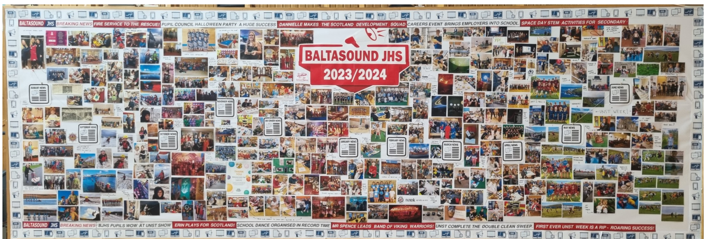
Last Year's Achievement Wall Display.

As is tradition in BJHS, we love to celebrate the achievements of our pupils. This is done through the class teacher, TV Screen, assemblies or on the achievement wall in the main hall. If your child has achieved something you would like us to share (that we might not know about), please contact the main office to ensure we can recognise this in school.